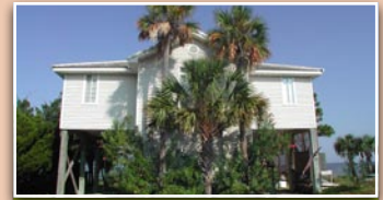
MLS# 240872 ... $645,000

ISLAND BUNGALOW Great view to the Gulf from upstairs deck. Located on West Pine Avenue, this home offers privacy and seclusion on this high elevation property. The beach is a few blocks away. Nestled into mature trees, 4 BR, 3 BA, very livable floor plan, new AC, offered "as is." SOLD May 2010