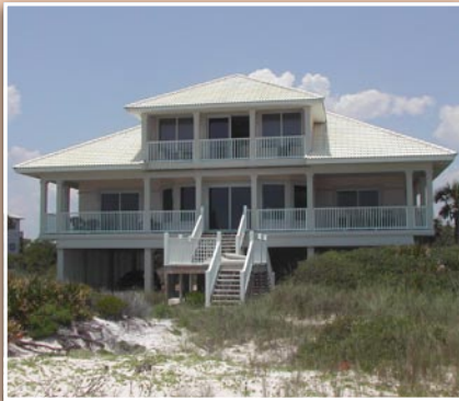
MLS# 240078 ... $1,399,000

PLANTATION BEACH-FRONT Huge open living room/dining/kitchen with coffered ceiling, 6 BR (3 Gulf front masters), 6 BA, elevator, NEW interior paint, carpet, SS appliances, custom woodwork, furnished, fireplace, ground level entry, 500 ft from the NEW pool and clubhouse!