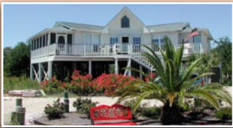
MLS# 239838 ... $399,000

BREATHLESS Directly across the street from the beach. Large lot extends from the beach road (East Gorrie Dr.) to the back beach road (Gulf Beach Dr.) eliminating a backdoor neighbor. Large spacious, open living/dining/kitchen area. 4 BR, 2 BA. Widows walk, large covered porch. Short Sale.