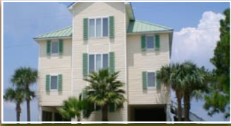
MLS# 240869 ... $679,000

ESCAPE Six feet deep at end of DOCK, two boat LIFTS. Spectacular sunset view! Completely remodeled interior (2006) w/ Italian tile, 3 BR, 2 BA, furnished, gourmet kitchen w/ granite counters, maple cabinets, SS Dacor gas range and microwave, pantry, screened room, room for pool on east side of lot.