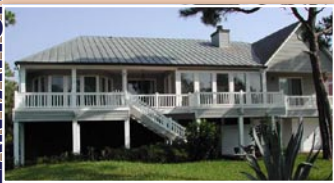
MLS# 238824 ... $439,500

ST. GEORGE PLANTATION Located on Blueberry Rd, open, gourmet kitchen, just off the large living room with fireplace is a cozy sunroom, huge master bedroom with HIS and HERS (with sunken tub) bathrooms. (Total 3 BR, 3 BA), screened verandah, game room and LOTS of storage. One-acre lot is attractively landscaped.