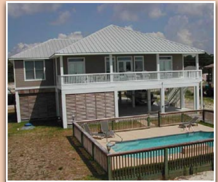
MLS# 239699 ... $650,000

ELEGANT HOME 2nd tier from the beach with great Gulf views! 4 BR, 4 BA, office separate dining room, rustic pine floors, chair railing, arched doorways, crown molding, furnished, POOL with waterfall, landscaped, circular driveway, easy beach access, 2,700 h/c sq. ft., quality construction, income producing.