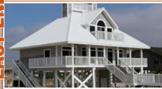
MLS# 103539 ... $1,250,000

KEEP COMING BACK Beautiful island home, professionally remodeled and upgraded within last 5 years. 3 BR, 2 BA, office, vaulted, beamed ceiling in living room, secluded screened porch, hurricane shutters, circular drive, very nice Gulf view! Move-in condition. West Gulf Beach Drive. Listed by Michael Billings.