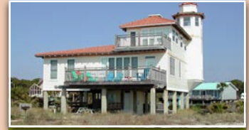
MLS# 239215 ... $649,900

ISLAND GETAWAY Attractively landscaped Canal and Bay view lot with a cute house built around and incorporating a mobile home with roof over. 3 BR, 1 BA, nicely tiled bath, lovely porches and decks lead to a well maintained yard, quiet neighborhood on Gibson Street.