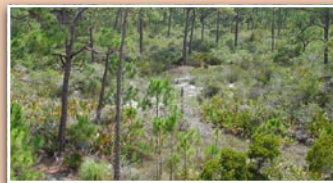
MLS# 234168 ... $118,500

ST. GEORGE PLANTATION Located on Blueberry Rd, open, gourmet kitchen, just off the large living room with fireplace is a cozy sunroom, huge master bedroom with HIS and HERS (with sunken tub) bathrooms. (Total 3 BR, 3 BA), screened verandah, game room and LOTS of storage. One-acre lot is attractively landscaped.