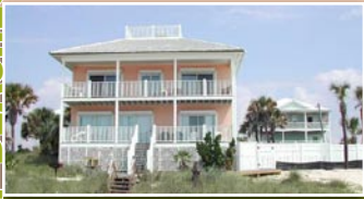
MLS# 239458 ... $899,000

BEACHFRONT SEA DREAM 3 master bedrooms opening to Gulf front porches, 3 baths, widows walk, roll down shutters, 100 ft directly on the Gulf of Mexico, exterior renovation completed including New POOL and decks! Roadside curb appeal on West Gorrie Drive. Popular rental = income!