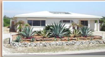
MLS# 239766 ... $799,000

COMMERCIAL BLDG Two bedroom residential unit on the top floor facing the Gulf. Smaller upstairs office facing the Bay. Four Commercial lots with approx. 65 x 135 of parking. Front and back exterior staircases. Gulf side and Bays side uncovered decks, excellent rental potential. Short Sale.