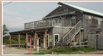
MLS# 238218 ... $549,000

TRULY A BEAUTIFUL HOME! 5 BR, 3 1/2 BA, new SS appliances, fully furnished, fireplace, 2nd living area upstairs, great Gulf views, corner lot makes for easy each access, POOL and spectacular landscaping; immaculate condition, OUTSTANDING rental income! UNDER CONTRACT