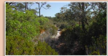
MLS# 239630 ... $199,000

HEAVEN CAN WAIT Located in Sea Dune Village, this 3 BR, 2 BA home has beach cottage appeal on a 2nd tier, one-acre lot, spacious living room with stone fireplace, newly renovated community tennis court on adjacent lot, easy beach access, air strip, 24 hr. security, new pool and club house. Short Sale. UNDER CONTRACT