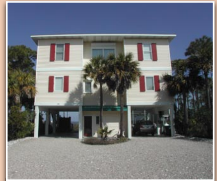
MLS# 239121 ... $699,000

THE PERFECT BAY FRONT HOME! Open kitchen, dining, living room with fireplace, PRIVATE DOCK with LIFT, second living area with wet bar, 4 BR, 3 BA, furnished, 10 ft ceilings, arched doorways, SCREEN enclosed POOL & spa tub, hurricane shutters, one-acre lot, located at the end of Watkins Cove.