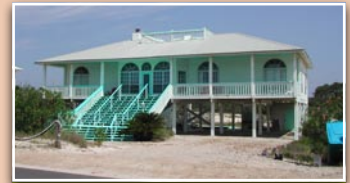
MLS# 240516 ... $449,000

ISLAND OASIS Partially covered courtyard with waterfall. Huge living and dining rooms, gourmet kitchen, 4 BR, 5 1/2 BA, private walled POOL/hot tub area. Covered outdoor dining area. Handicapped accessible. 1st tier, huge elevated deck with spectacular Gulf view. Top quality house without stairs!