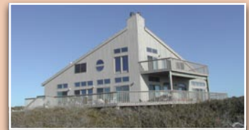
MLS# 239713 ... $1,349,000

AS CLOSE AS IT GETS BAY FRONT 2 BR 2 BA, Turn-key furnished rental ready house. Cedar paneled ceiling and some walls in kitchen and dining rooms. Two very spacious bedrooms! Laundry room, nicely appointed kitchen, vinyl siding, DOCK, gutters, fireplace. Short Sale. UNDER CONTRACT