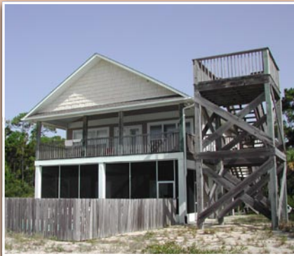
MLS# 240661 ... $397,900

FEEL THE BREEZE Great Gulf view from quiet East Pine Ave., 5 BR, 3 BA (2 separate bedrooms and a bath downstairs at ground level with private entrance), tastefully furnished, tile floors, vaulted ceiling with outstanding crown molding, elevated observation platform. POOL!