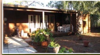
MLS# 239058 ... $237,000

LOT IN PEACEFUL NEIGHBORHOOD Building site is located on East Pine Avenue. This dry lot has both Bay and Gulf view potential. Lot measures 100 x 175. Only a few blocks to the Gulf of Mexico. Not a Short Sale, just priced to sell. SOLD July 2010